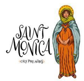
PK - 2 SAINT

Rejoice in hope, be patient in tribulation, be constant in prayer. Romans 12:12